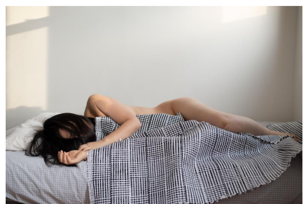
BANG GEUL HAN , Warp and Weft #03 – Sleeping, 2022, archival inkjet print, 40.6 \times 27.1 cm printed on 55.9 \times 43.2 cm paper.

"Bang Geul Han: Land of Tenderness" <a href="The 8th Floor">The 8th Floor</a>, New York