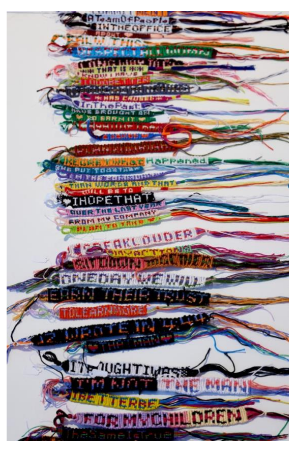
Detail of BANG GEUL HAN 's Apology Bracelets (Harvey), 2022, cotton embroidery floss, 304.8 \times 50.8 \times 27.9 cm, at "Land of Tenderness," The 8th Floor, New York. Courtesy the artist.

Like the tapestries or jewelry displayed, the exhibition weaved together the subject matter of immigration and the female body. Simply yet cogently, it conveyed the confinement and control institutions of power place on bodies in the name of regulation or entertainment. Moreover, Han's art not only underlined some of the noxious documents of the Trump era in particular and the history of the US government in general, but it also transformed them, integrating them into mixed media meant for open communication, care, and compassion.