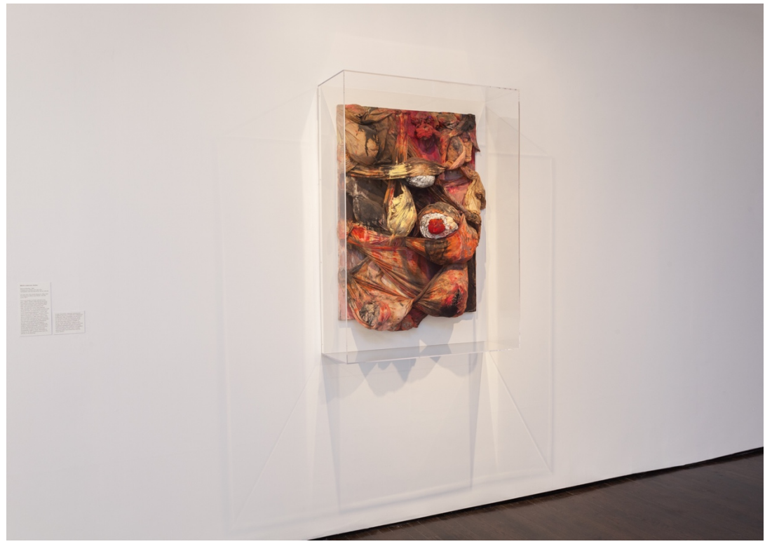
Mierle Laderman Ukeles, Second Binding, 1964

historically told to take a back seat—so we asked: what is a stronger stance a woman can take? To be too bold is always the risk but in a way is a requirement if change is going to happen.