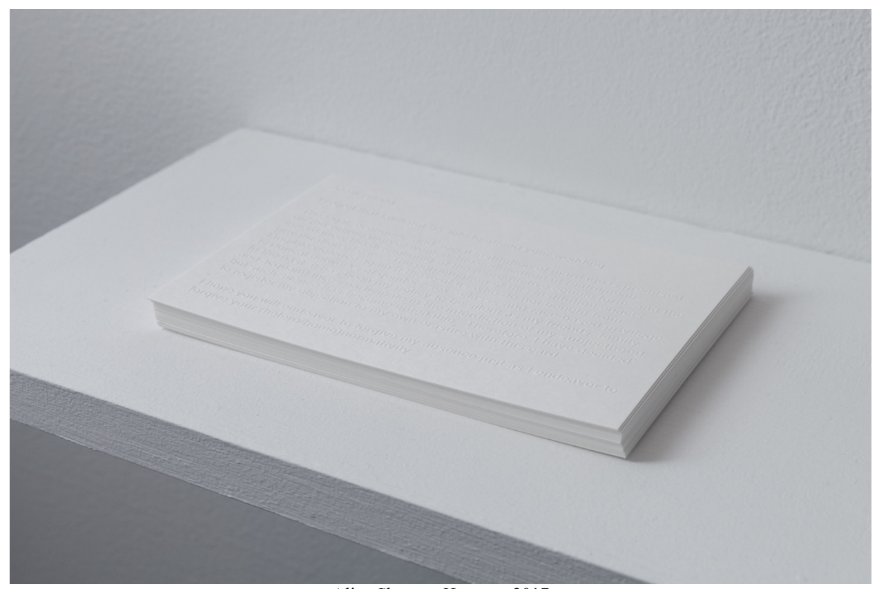
Aliza Shvarts, Homage, 2017

SR : There's also the idea of paternalism that links to patriarchy but it's less pointed. That's maybe the friendlier or kinder notion that someone is looking out for you. But then the question becomes, how much do you want to be looked after as an autonomous, independent woman? Do you need that looking after? That system? I think traditionally women have been protected by men, but as we see in contemporary life, that protection is not always in our favor.