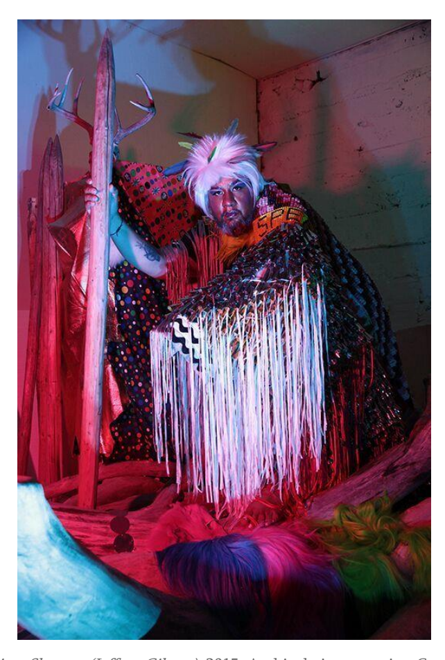
Elia Alba, The Disco Shaman (Jeffrey Gibson), 2015. Archival pigment print.

EA: For me staging a photograph is similar to painting a canvas, and creating a decisive moment. Photography doesn't always have to be spontaneous, in other words, documenting a moment as its happening. It is a creation built with the imagination of the photographer. I didn't just want to document the artists in a straightforward manner or depict working in their studios. I wanted to tell a story and make the artists into iconic archetypes that embody their persona and their practice. The staging of the photographs not only highlighted each unique individual, but also created a platform that connects them to the world.