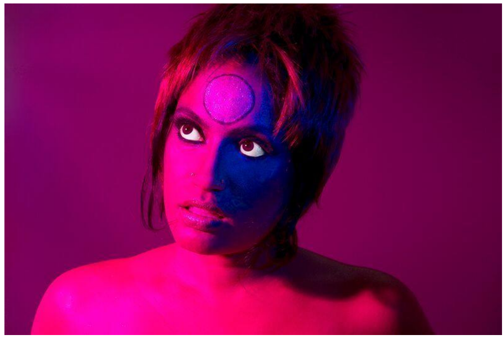
Elia Alba, The Dreamweaver (Chitra Ganesh), 2013. Archival pigment print.

JH: The Supper Club began in 2012 as a photography-based project, which then inspired the group dinners that the exhibition's title alludes to. Can you talk about this transition?