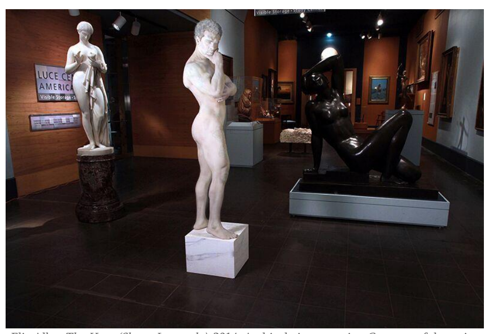
Elia Alba, The Hero (Shaun Leonardo) , 2014. Archival pigment print.

JH: Light is fundamental to all photographers, and your work, which possesses a masterful sense of color, is no exception. The wall text cited the influence of fashion photography on your aesthetic. How does that manifest for you?