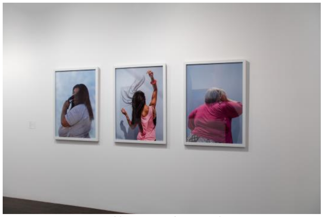
Installation view of 'The Power of Your Care' at the 8th Floor

interventions can push beyond the need for self-care to a directive for community care.