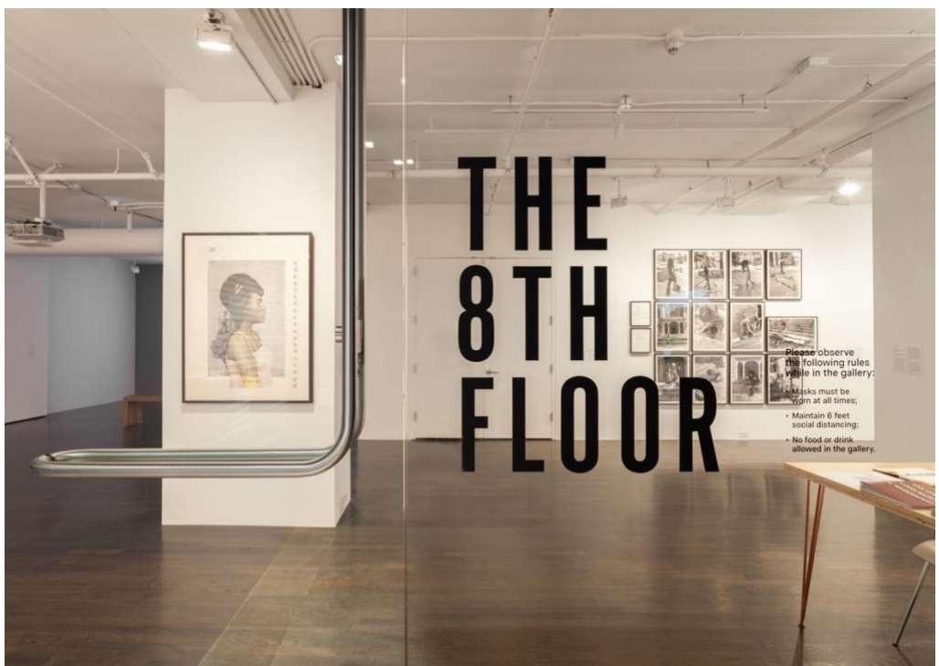
Installation photo, To Cast Too Bold a Shadow , October 15, 2020 - February 6, 2021. The 8th Floor.

Subjugation, Consent, and Active Resistance: To Cast Too Bold a Shadow at The 8th Floor