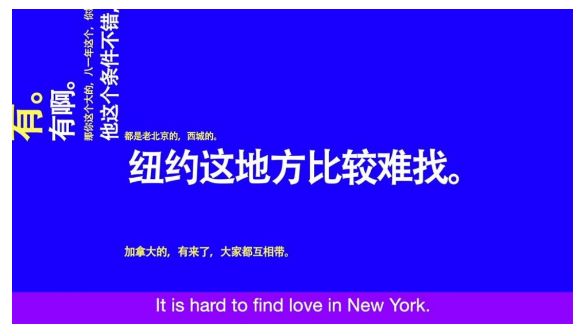
Furen Dai, Love for Sale , 2020. Video (color, sound), 7:03min. Video still.

Various strands running through this exhibition are aptly captured by the exhibition title originating from a 1960s poem by Adrianne Rich, "Snapshots of a Daughterin-Law." In this poem Rich describes the universe constructed by and for men where we, women, are present in our difference, in our divergence from the norm, from the dogma and the expected molds. All works selected for this exhibition show the resistance, feminist unwillingness to succumb, or at the very least they shine the light of reason onto mindless patriarchal rituals of power. Traditions, social customs and their dogmatic, inescapable, stabilizing pressure constitute the foundation of a status quo, a factor so cynically used by men to justify the suffering, abuse, negligence, othering of women. Yet, the exhibition also includes satisfying alternatives, creative avenues of resistance and fight. Commodification of women as objects for marital transactions, othering, question of consent, and active resistance by women are the themes I picked up, but the show tells multitude of stories, waiting to be discovered by the viewers.